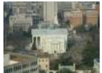
Capital Building Richmond, VA

Not only do we look forward to our second CRLA conference, but we also enthusiastically look forward to our first CRLA presentation. With that said, feel free to stop by, learn about managing a large number of student employees/tutors, and say hello. We can't wait to meet you.