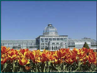
Lewis Ginter Conservatory, Richmond, Virginia